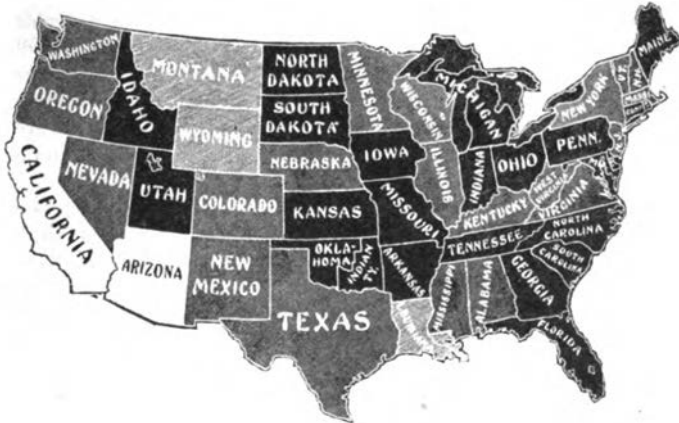
SUNDAY LAWS CORRECTLY REPRESENTED.

It was Sunday legislation which plunged Europe into the dark ages and the Inquisition. And this is where it will lead the world again to-day if it starts once more on this "backward" road.