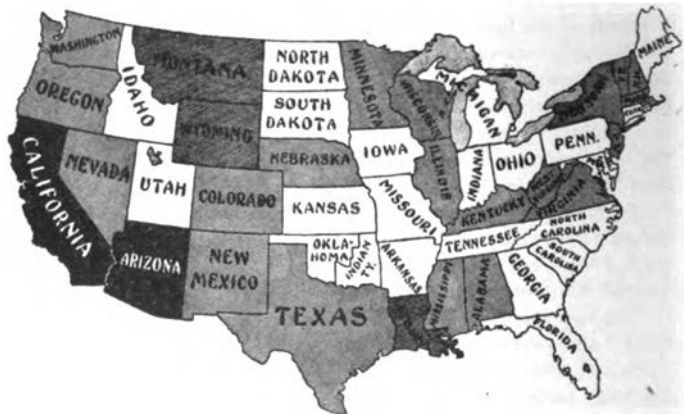
SUNDAY LAWS AS REPRESENTED BY NATIONAL REFORMERS.

But the question naturally arises, How far back will Sunday legislation lead a State? To what lengths will the logic of such legislation carry civil government? When a State starts on this road, where will it end? It would be absurd, indeed, to imagine a State having